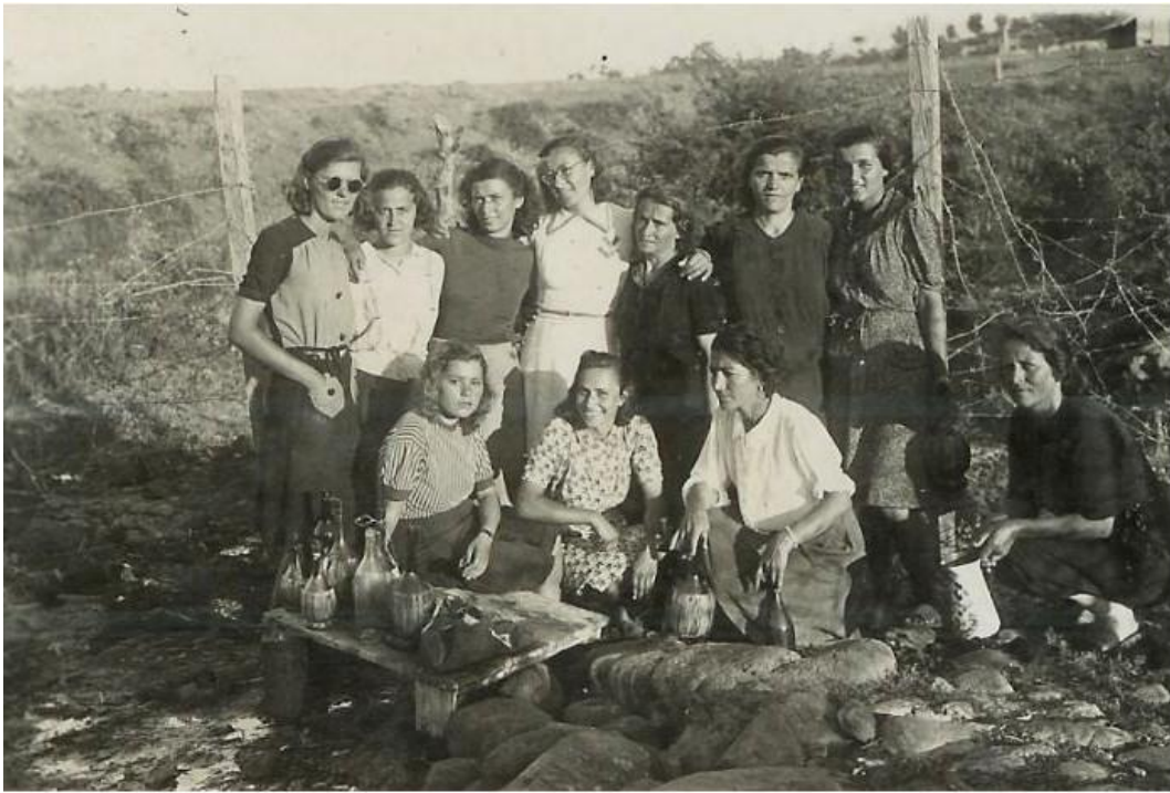
Albanian and Jewish women, Burrel, 1943.